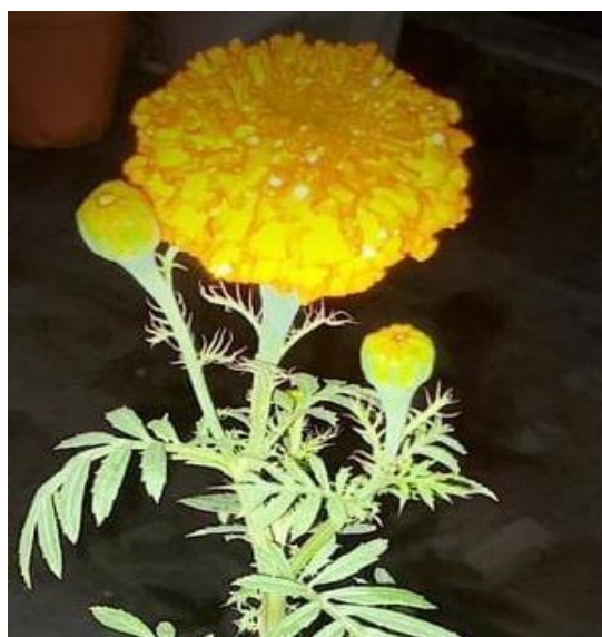
Fig. 1: T. erecta (Marigold) grown in garden

Tagetes species, contains about 56 species belonging to the Asteraceae family, popularly known as marigold, are grown as ornamental plants and thrive in varied agroclimates. Bioactive extracts of different Tagetes parts exhibit nematocidal, bactericidal, fungicidal and insecticidal activity. Nematocidal activity of roots is attributed to thienyls while the biocidal components of the essential oil from flowers and leaves are terpenoids. Also carotenoid pigments from Tagetes are useful in food coloring.