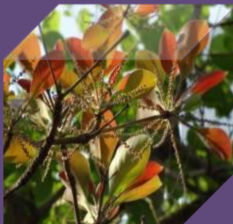
Terminalia bellerica (Baheda)