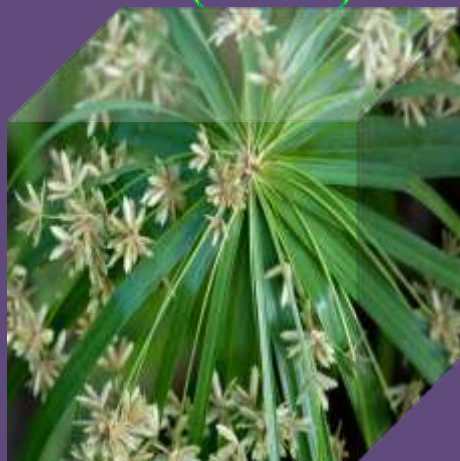
Cyperus scariosus (Nutgrass)

Indexed by International Impact Factor Services, Scientific Journal Impact Factor, International Institute of Organized Research (I2OR), Advanced Sciences Index (ASI), International Scientific Indexing and Cite factor. Crossref Member Digital Object Identifier (DOI) Assigned Website: www.ujpah.in