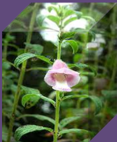
Sesamum indicum (Sesame)

AMR and Indian herbs as promising source of antimicrobial compounds