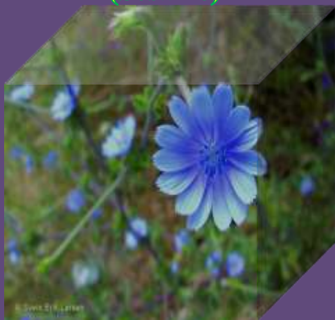
Cichorium intybus (Chicory)